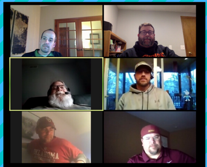
FISHERS OF MEN