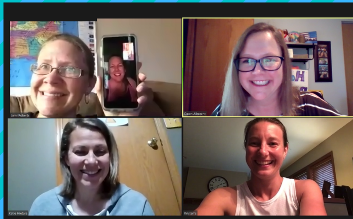
CHILDREN'S MINISTRY TEAM